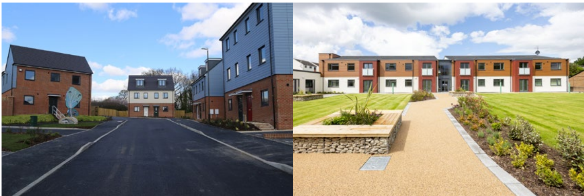
Above left: Badger Croft - Brockwell Court - a new council housing development that has been built on the site of the former Brockwell Court. Each of the new properties has increased levels of insulation.

As part of the refurbishment of Aston Court, electrical services will be upgraded and will replace previous gas provision. New solar panels and enhanced insulation will also be installed to improve efficiency.