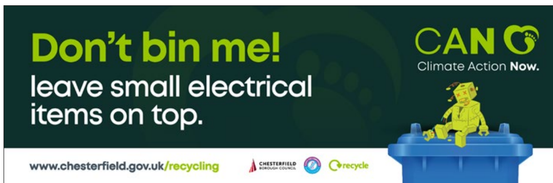
Above: an example of recycling campaign and information on the council's bin lorries