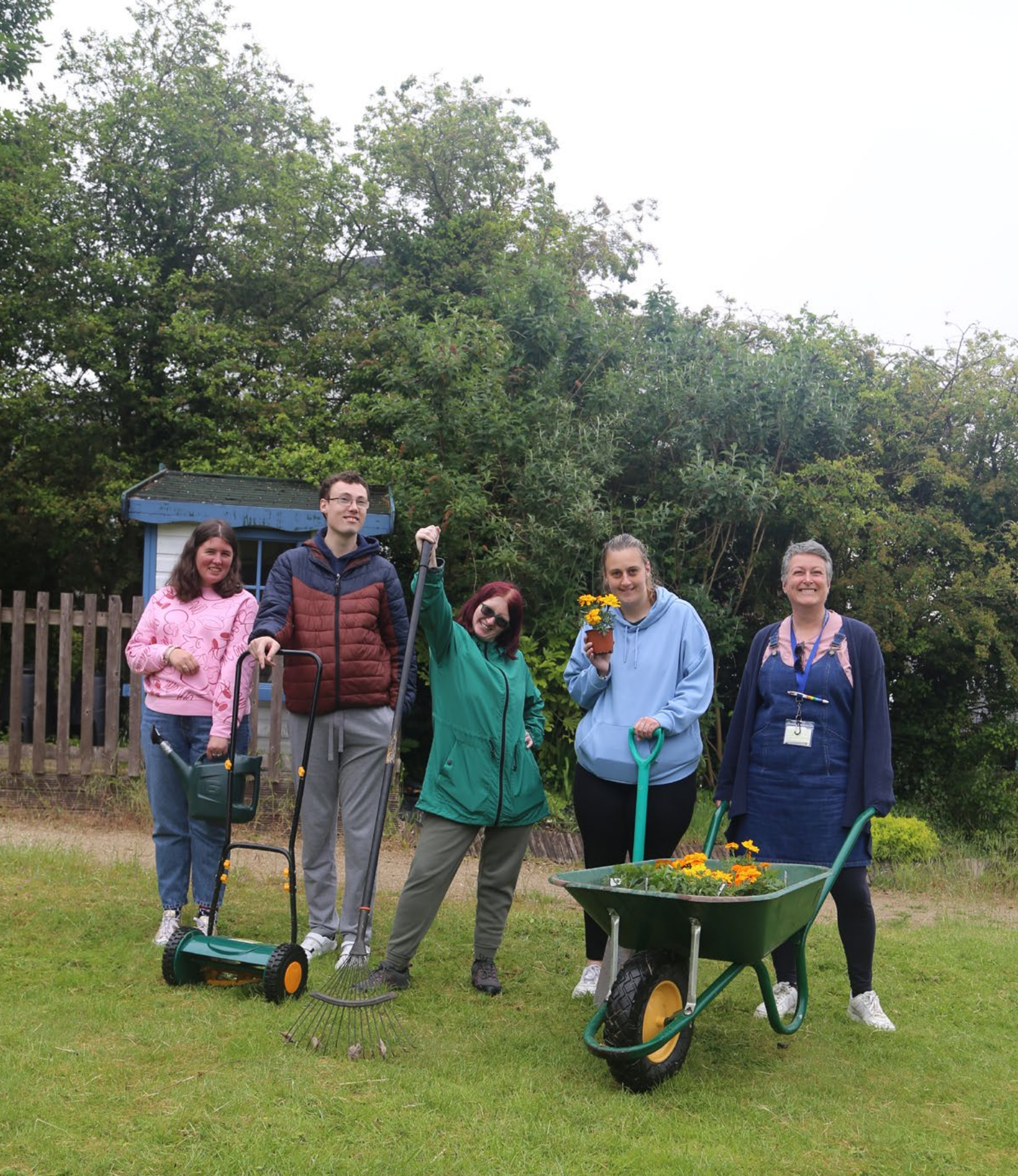
Above : Fairplay is one of the groups to have received grant funding. The charity supports children and young people with disabilities and additional needs, and their families, across North Derbyshire. Funding will be used to support a new project that will give young people with learning disabilities the chance to engage in work-based activities within their communities.